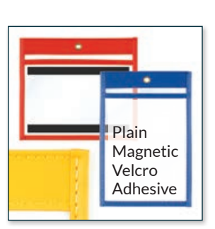
Rigid Sewn Pockets