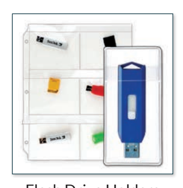
Flash Drive Holders