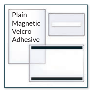
Rigid Print Protectors