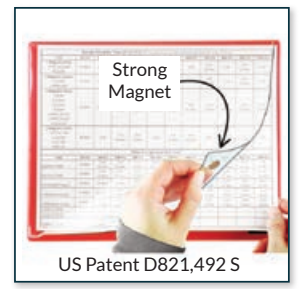
Magnetic Closure Pockets